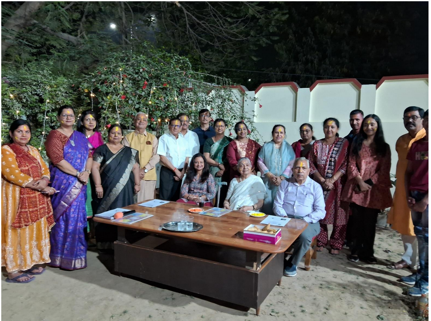
A Group Photograph after the Holi Milan